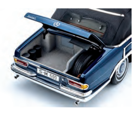
Counterweights in the trunk and on the vehicle floor take into account the changed balance of the Landaulet.