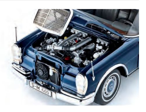
It must have been a pleasure to listen to the powerful revving of its powerful V8 with the bonnet down.