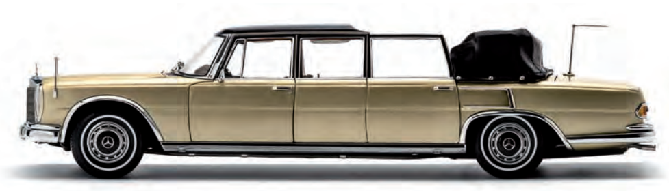
M-217 CMC Mercedes-Benz 600 Pullman Landaulet, 1970