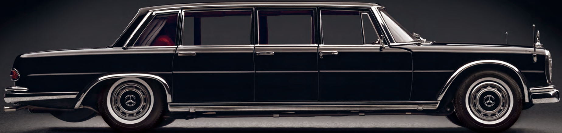
[7] Art.-Nr. M-200 CMC Mercedes-Benz 600 Pullman sedan, black exterior, red interior

Flag poles are included in the tool box, so are hub covers, which adhere magnetically