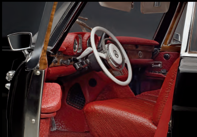
[1] Sophisticated Interior, which is composed of genuine leather upholstery and detailed precious-wood décor

In its presentation of this landmark vehicle, CMC first offers the six-door, 6-/7-seater version of the Pullman limousine.