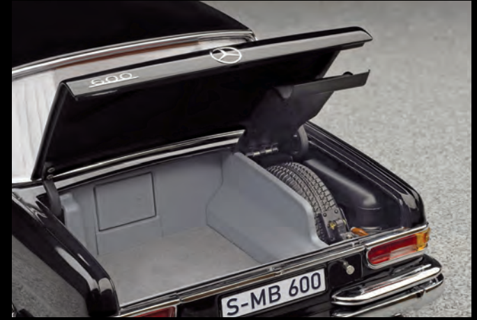
[6] Minute presentation of the spare wheel and vehicle tools in trunk

As in the original car: Rear doors equipped with wind deflectors, and rear windows furnished with curtains