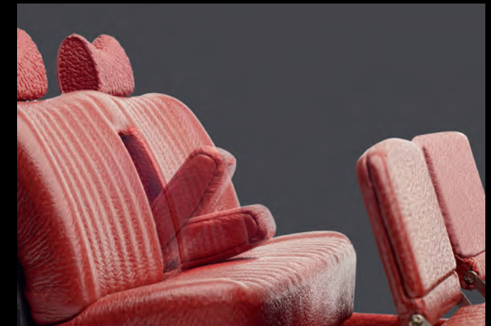
[3] Rear bench seat with a foldable middle armrest