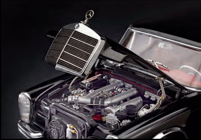
[4] Authentic replication of the bonnet, including its hinges and springs