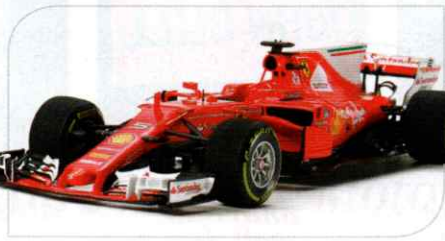
Tamiya 1:20 2017 Ferrari SF70H