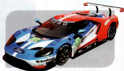
Revell 1:24 Ford GT Le Mans