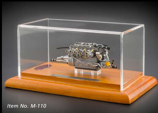
Item No. M-110

Much of its success is attributable to its sinewy engine, which is similar to the famous Formula 1 engine of the Maserati 250F in many ways. Thanks to its powerful drive, J.M. Fangio raced his 250F to the 1957 World Championship. This led Stirling Moss and several other famous race drivers to put their faith in the 300S 3-litre 6-cylinder engine. Apart from a number of top finishes, the 300S won the famous 1,000 km endurance race at the Nürburgring in 1956.