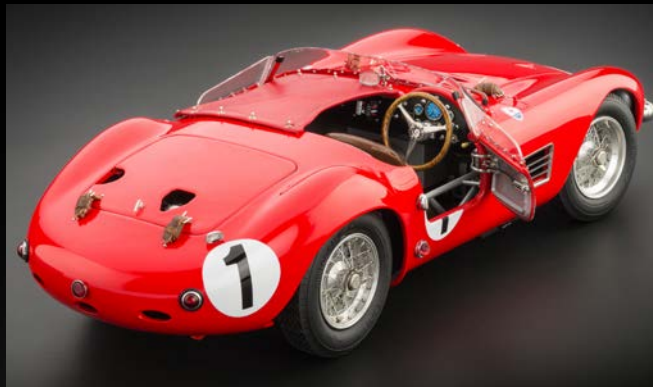
Two functional doors, and removable bonnet and trunk lid. Another highlight in CMC's efforts -- an exquisite 1:18 scale model.