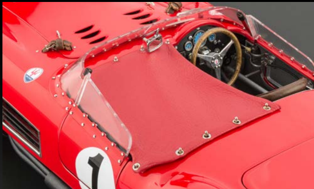
The seats and co-pilot cover are upholstered in genuine leather. The instruments of the dashboard are authentically recreated.

In 1955 Maserati introduced the 300 S, a racing car that achieved many top finishes and victories in international competition.