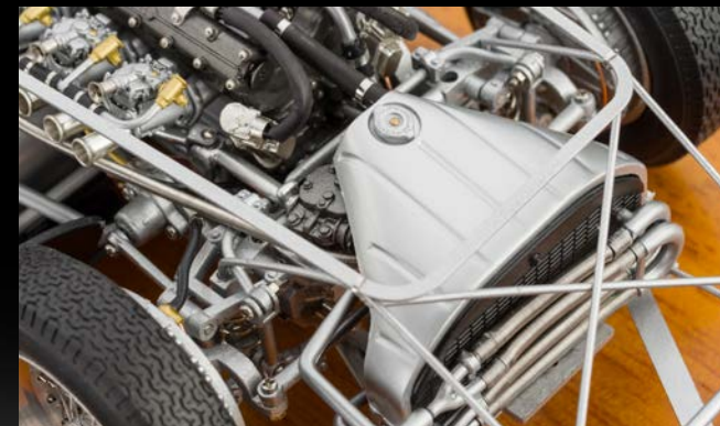
An awesome amount of detailing. Even the elaborate suspension and the brake unit are recreated true to the original.